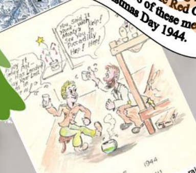
CHRISTMAS 1944 STALAG LUFT III Alcohol was made by fermenting raisins from Red Cross parcels.

"We had the room decorated and a small tree but the spirit of the season was not present. The Red Cross provided a special parcel for the season and we did have a fine meal."